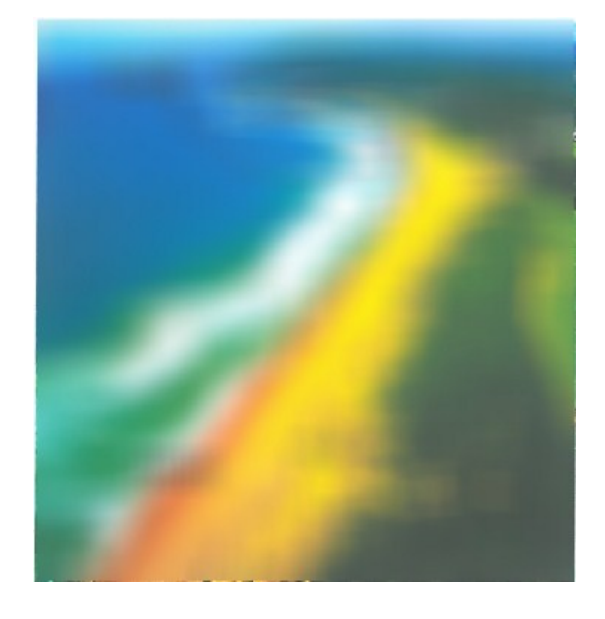
(figure 0.1) The longshore drift of sand from the south of XXX beach to the north.