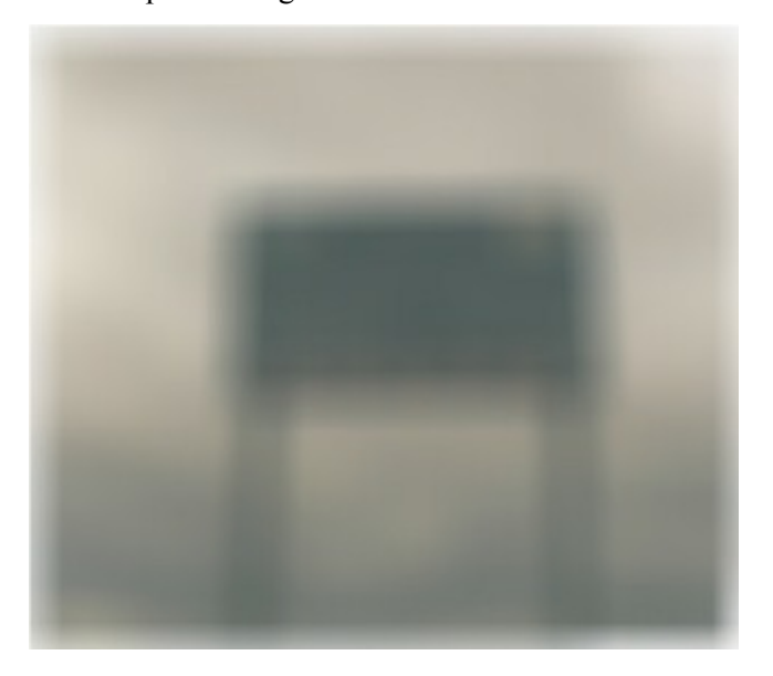
(figure 0.4) Writing on sign is too small